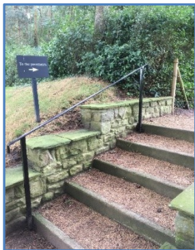
The first safety rail at Aldborough Museum

Complete list of dates on www.lowerurenews.co.uk