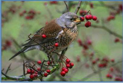
Fieldfare 1

Many thousand thrushes join our resident birds each winter to escape the harsh climates of northern Europe and take advantage of the abundant food provided by our milder UK winters, so if you are out and about in the countryside, you may well encounter flocks of Redwing and Fieldfare, often mixed together.