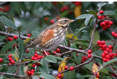
Redwing John Harding/BTO

Species varied in their prevalence and landscape use. The most ubiquitous was the Blackbird which occurred in 93% of all squares surveyed throughout the winter. While the species encountered least frequently was the Mistle Thrush, seen in only 55% of all squares surveyed. Species also differed in their tendency to form flocks. The average