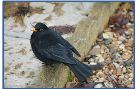
Male Blackbird in breeding plumage with prominent yellow beak and eye ring.

Blackbirds were originally woodlands birds, but have adapted very well to an urban environment. It is thought urban Blackbird populations may even act as boosters for less productive woodland populations! Prolonged periods of dry weather, which make getting at earthworms very difficult puts their chicks at risk of starvation. Woodland populations suffer from nest predation.